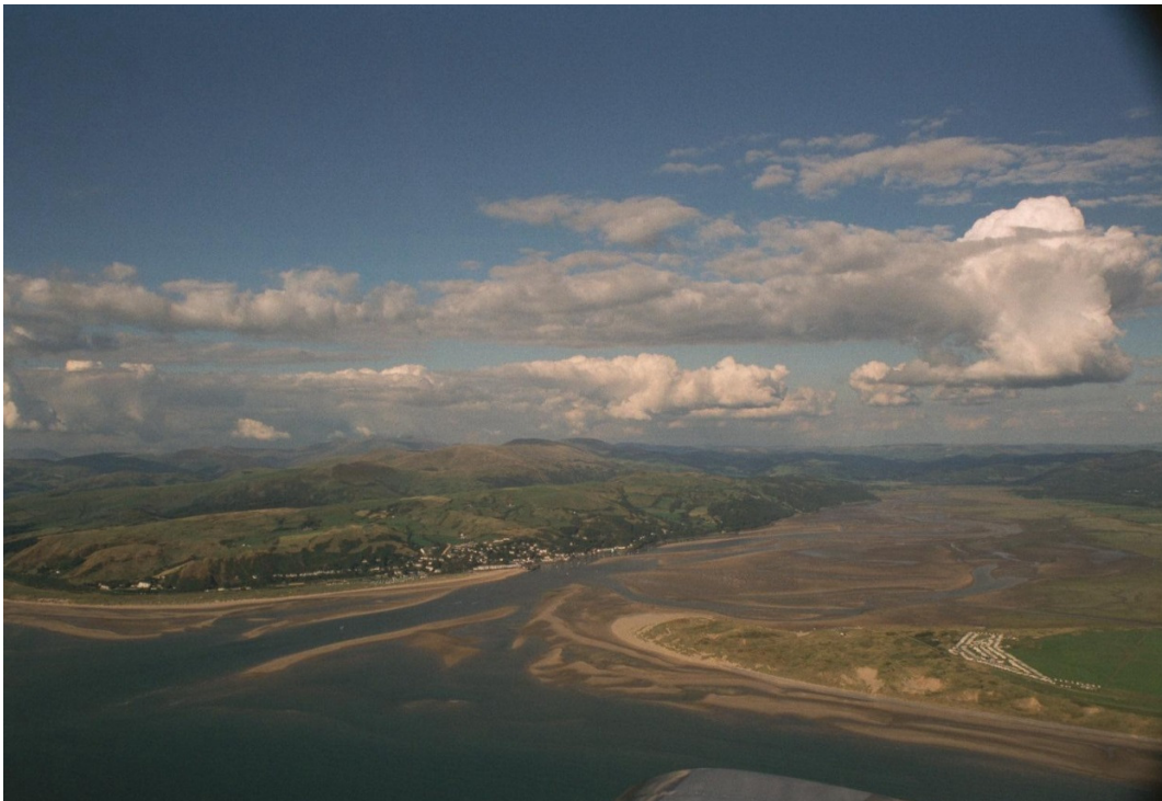
The Dyfi estuary

The Dyfi Biosphere will be recognised and respected internationally, nationally and locally for the diversity of its natural beauty, heritage and wildlife, and for its people's efforts to make a positive contribution to a more sustainable world. It will be a self confident, healthy, caring and bilingual community, supported by a strong locally-based economy.